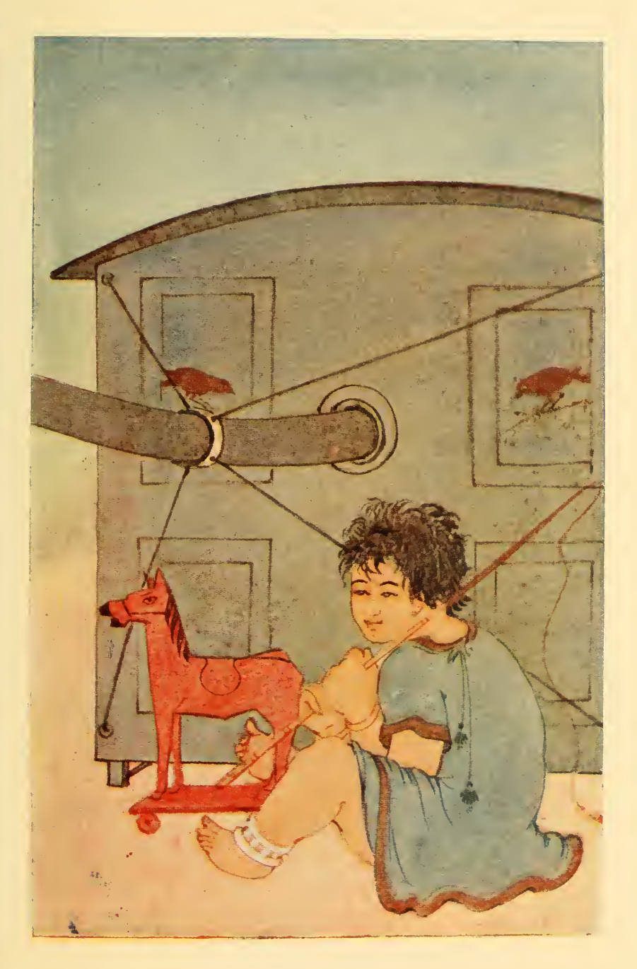
THE HERO. From a drawing by Nandalall Bose.